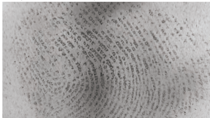
Natural latent fingerprint on Compact Disc (data side)