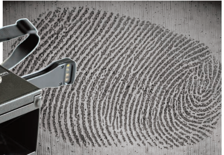
Clip-on accessory for imaging evidence on mirrored and highly reflective surfaces.