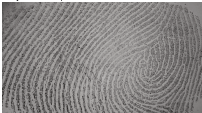
Sebacious latent fingerprint on glass

foster+freeman Forensic Science Innovation