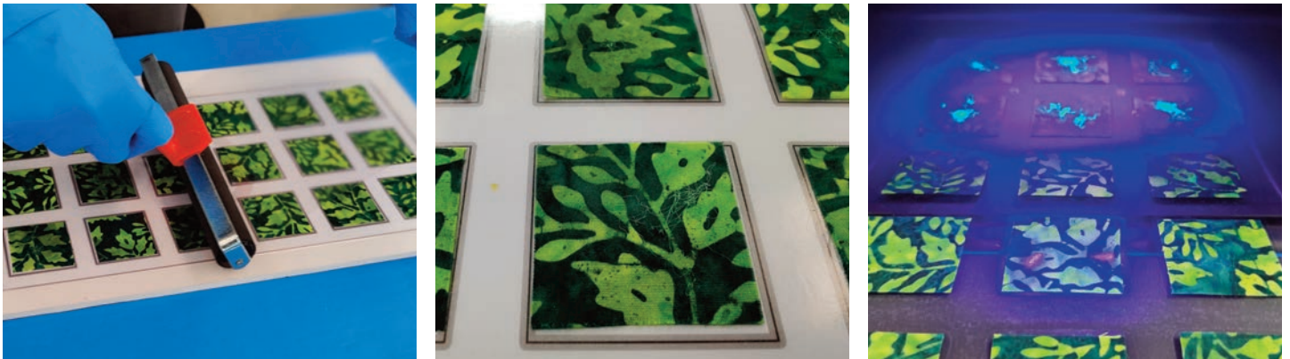
Samples are prepared under laboratory conditions