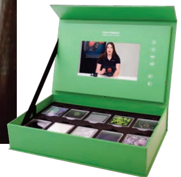
Each sample includes guidance on the optimum illumination/viewing filter combinations

foster+freeman Forensic Science Innovation